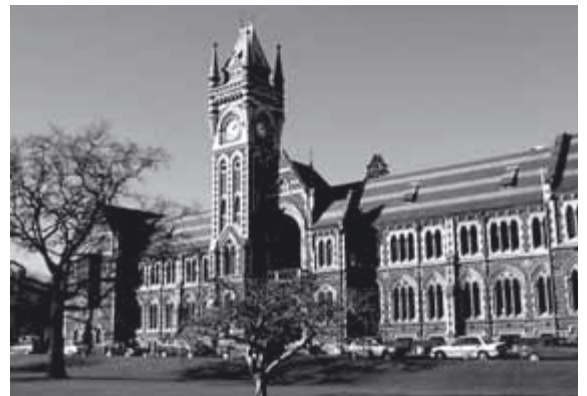
University of Otago.

But not everyone treated us as enemies. Here in Dunedin, unlike the mainline churches, the Religious Society of Friends, commonly known as the Quakers, made a point of befriending enemy aliens.