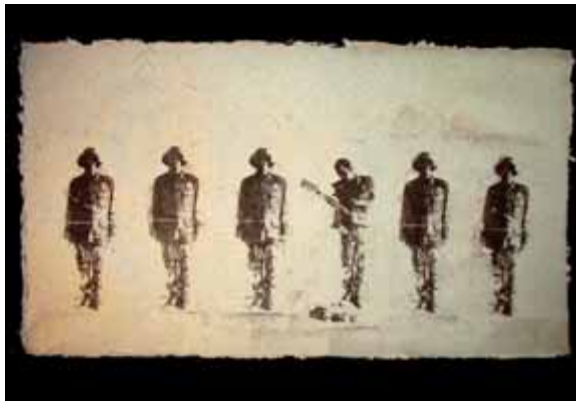
'Breaking rank', a work from the CCP exhibition.

This is an intriguing project which was founded in 2007 by a group of US veterans, many suffering PTSD, who pulp their uniforms to make paper as the basis of artworks dealing with their experiences. The project has been successful in helping veterans rebuild their lives, as well as raising public awareness of the realities of war and the difficulties those involved face in the aftermath. CPP is a non-partisan organisation which aims to bring together veterans of conflict irrespective of their background or specific war experiences. Their work has been acquired by Harvard and Princeton University libraries and the Library of Congress in the U.S.