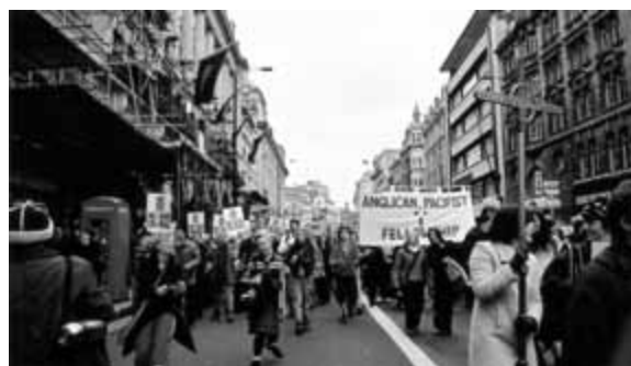
Opening photograph for the exhibition: the 2003 demonstration in London against the Iraq war

Visit the exhibition (page 8) if you can and fill in our questionnaire