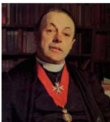
Dick Sheppard in Royal Chaplain garb

The 1930s were heady days for the peace movement, with Anglican pacifists taking the lead, encouraged by a bishops' resolution of 1930 that "War, as a means of settling international disputes is incompatible with the teaching and example of our Lord Jesus Christ". The foremost figure was Dick Sheppard, a Canon of St Paul's, who started the Peace Pledge Union (PPU), an organisation which grew to over 100,000 members all of whom signed a pledge that they would refuse to fight in war.