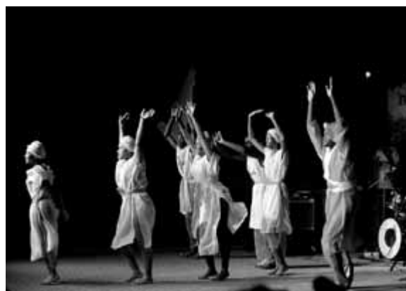
"Light in darkness." Dance performed at the opening of the 2011 WCC Peace Convocation.

○ Lord hear our prayer, our heartfelt, believing prayer and keep our minds alert to peacemaking our hearts aflame with peacemaking our hands active in peacemaking our feet moving always in the paths of peace. ○ Lord Jesus, Prince of Peace.