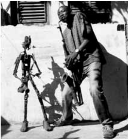
Sculptures from the 'Swords into Ploughshares' exhibition. The 'Throne of Weapons' is on the right.

In 1995, Bishop Dinis Sengulane founded the Transforming Arms into Ploughshares scheme (TAE) in Moputo. The country, one of the world's poorest countries, had a dangerous legacy of illegally-held weapons left behind after the prolonged conflict. As many as 7 million weapons were hidden at the end of Mozambique's civil war in 1992. Bishop Sengulane said "We tell people we are not disarming you. We are transforming your guns into ploughshares, so you can cultivate your land and get your daily bread."