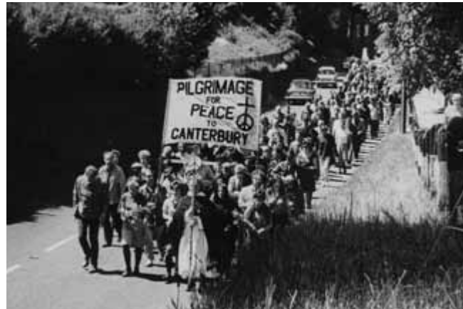
An early London to Canterbury pilgrimage.