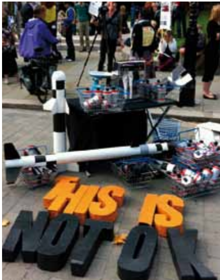
Demonstration at the DSEi arms fair.

The APF representative was also involved in unravelling the spy network that had infiltrated the organisation and was supplying campaign information to BAe. APF members continue to speak on international arms trade issues at political meetings and in schools. They also take part in CAAT's demonstrations particularly DSEi which is held every