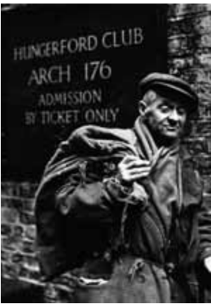
A member of the Hungerford Club