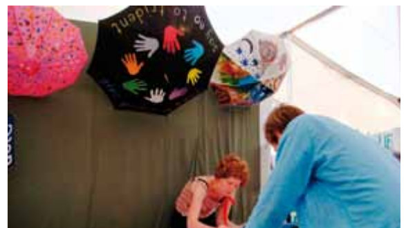
Art at Greenbelt