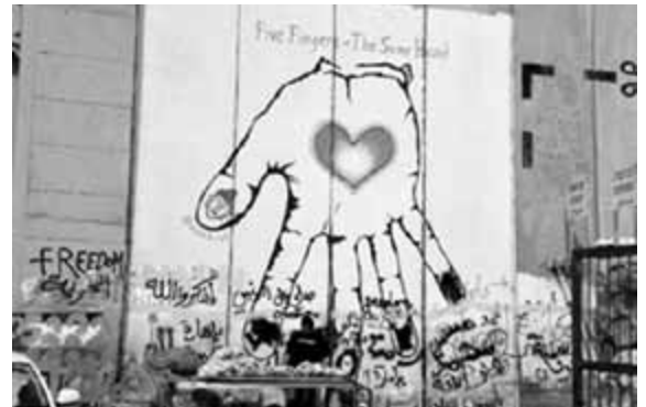
Five fingers - the same hand.

EPF has recently established PIN with the aim of contributing to a just peace for Palestinian brothers and sisters. The goal is to provide relevant information and links to valuable resources, to enable stronger, more effective advocacy and provide a place for PIN members to connect and collaborate. The website will post essays by PIN members and others which EPF hopes will inform, motivate and create rich and useful conversations. Anyone interested should visit the site.