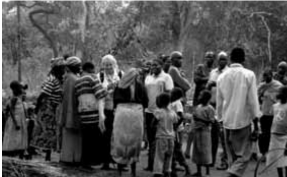
Showing some of the mothers their photos on my camera.

In December 2012, the situation about 40 miles south of here began to 'hot up'. Large numbers of people crossed the border into South Sudan. Things calmed down again and most returned. The Kakwa people live on both sides of the border and there are many marriages and family ties that bind the two communities.