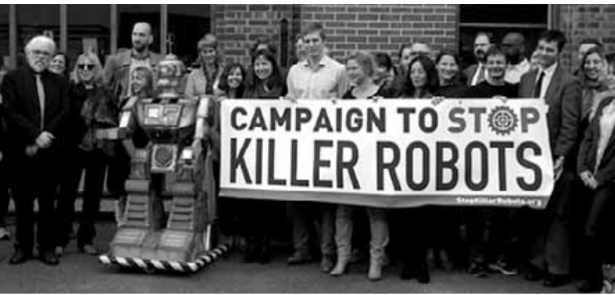
London launch of a new international campaign

‘No nation can preserve its freedom in the midst of continual warfare.’